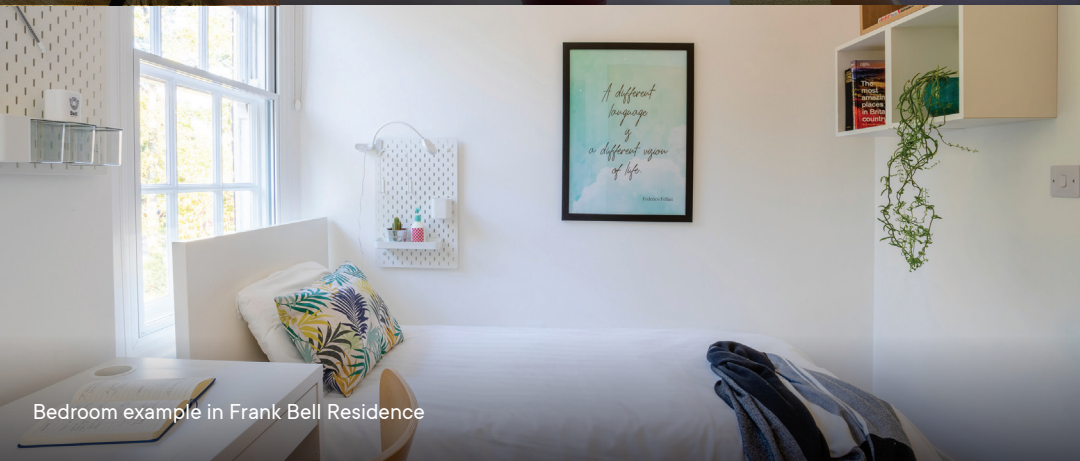
Bedroom example in Frank Bell Residence