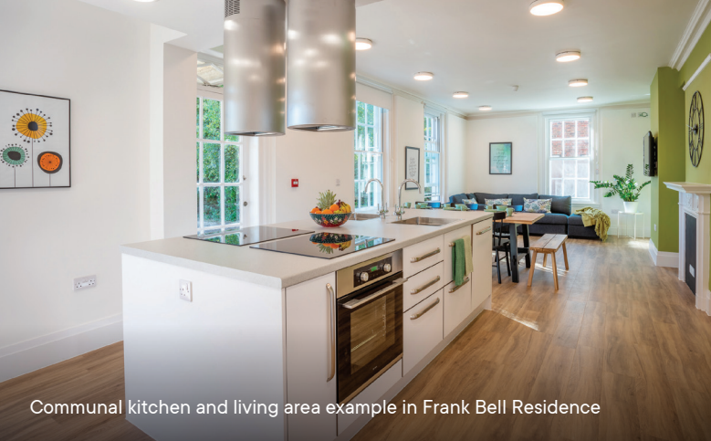
Communal kitchen and living area example in Frank Bell Residence