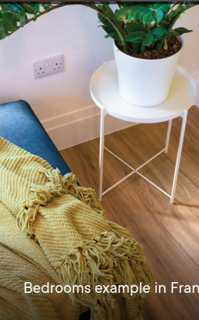
Bedrooms example in Frank Bell Residence