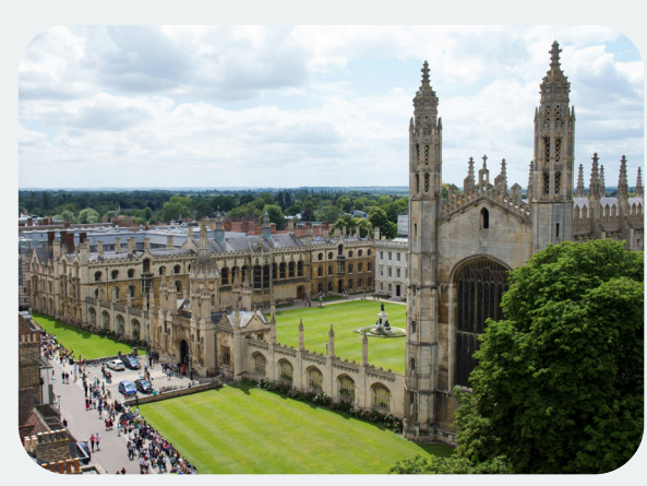
Monday 2 September Cambridge City Walking Tour for New Students