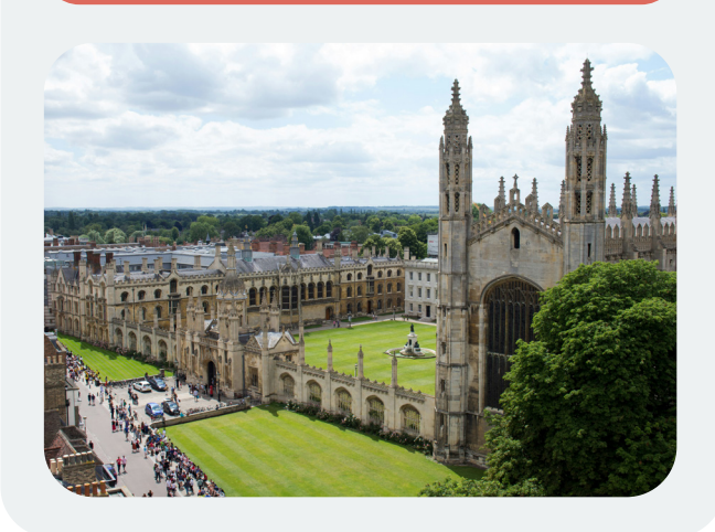
Monday 28 October