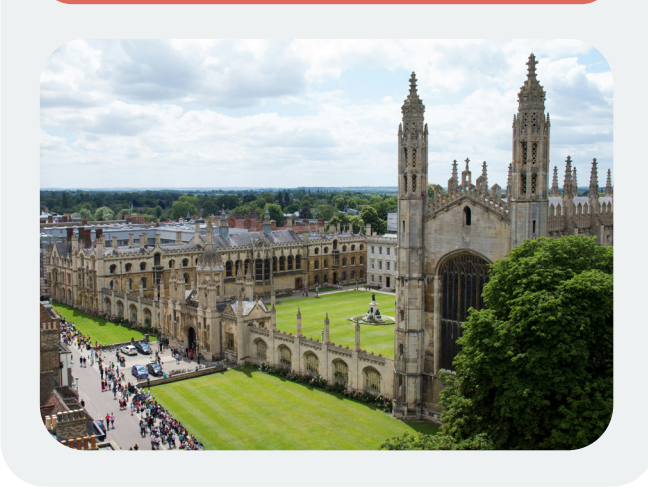
Monday 21 October