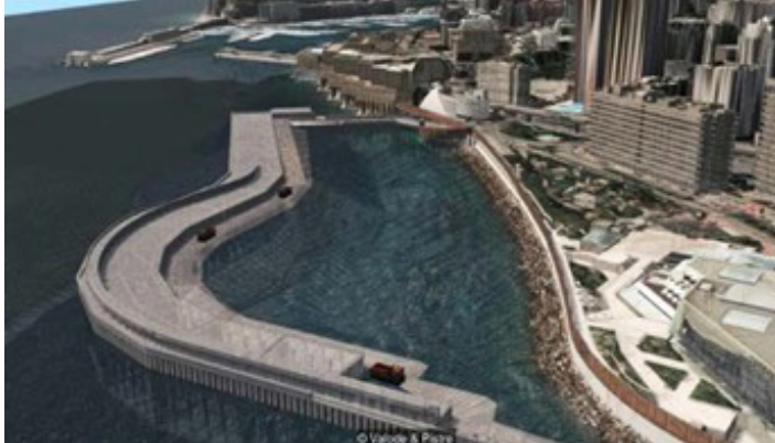
Architect rendering of the Portier Cove building site filled with water (Credit: Valode & Pistre)

Measuring just 0.78 square miles (2.02 square kilometres) Monaco is crowded, it's the second smallest country in the world (after Vatican City) and existing building