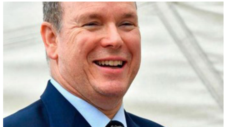
Prince Albert II, reigning monarch of Monaco, is devising ways to balance housing all the country's millionaires but also minimise environmental disruption

The unique challenge for Portier Cove is that the builders are being asked to meet international sustainable urban development certifications including the HQE Aménagement, Building Research Establishment Environmental Assessment Method standard and the Clean Ports label.